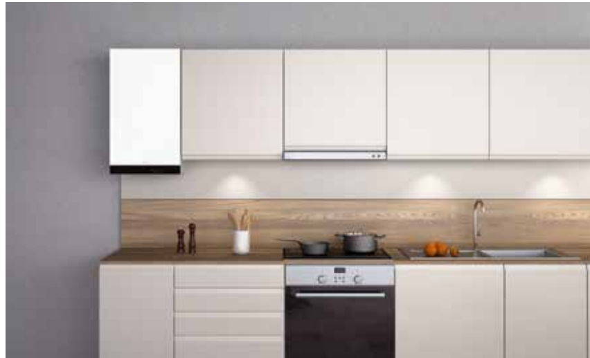
Vitodens 050-W with attractive design in Vitopearlwhite

With compact dimensions, low weight and quiet operation the Vitodens 050-W will integrate effortlessly into any living space.