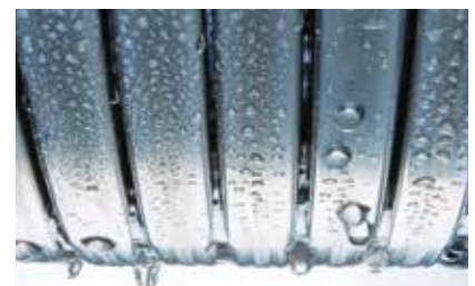
Inox-Radial heat exchanger

The Vitodens 050-W comes with a 7 year comprehensive warranty when registered through the Viessmann installer portal. There is also the option to extend by a further 3 years.